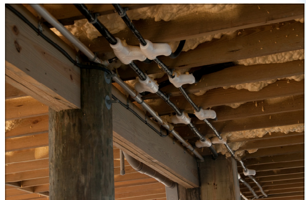
Daikin's REFNET piping system helped ease the HVAC installation in the Townsend's uniquely designed home.