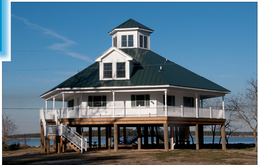
Daikin's flexible heating and air conditioning system gave the architect the freedom to design this amazing replica of the original Hooper Strait Lighthouse.